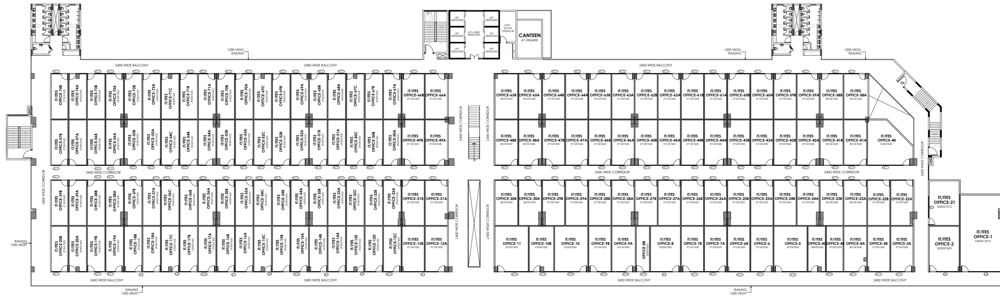
2ND FLOOR PLAN (LVL +11800)