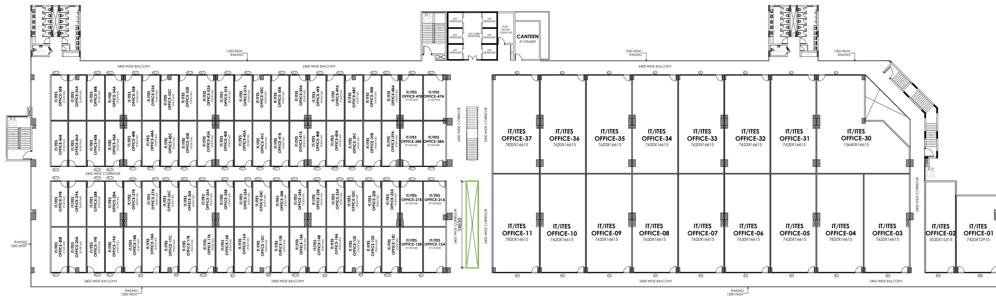
1ST FLOOR PLAN (LVL +7800)